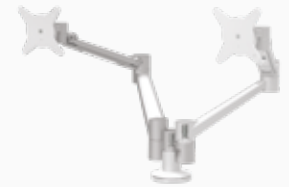
Expandable to dual screen version