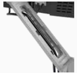
Integrated cable management