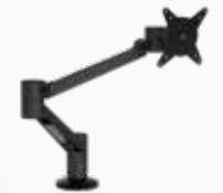
Also available in black